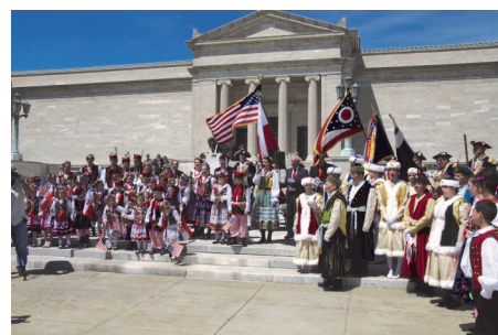
Rededication Ceremony: Monument to General Thaddeus Kosciuszko: 5/5/2013