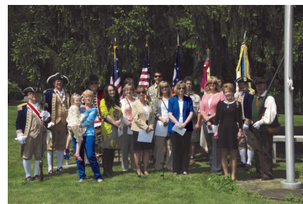
Above: Daughters of the War of 1812 Dedication Ceremony: Peninsula, Ohio: 5/5/13