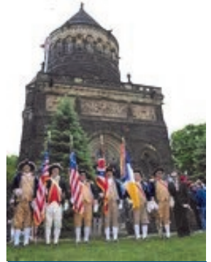
The Archibald Willard Color Guard at the annual Memorial Day Ceremony at Lake View Cemetery